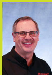
Dale Middle East